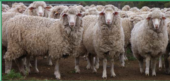
Photo rising 12 mths wool. → Photo taken 28.7.2011 →