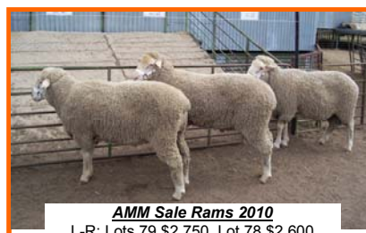
AMM Sale Rams 2010 L-R: Lots 79 $2,750, Lot 78 $2,600 & Lot 77(4T) $4,200